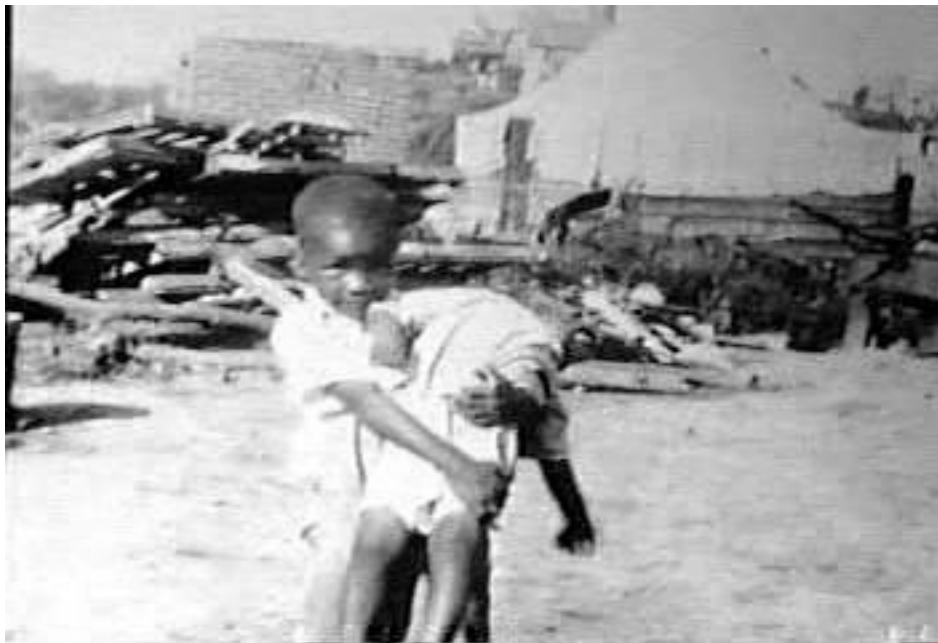
Tulsa Race Riot